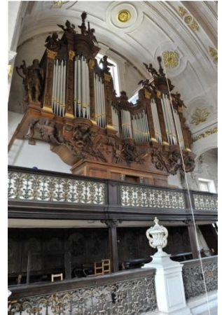
Antwerpen Carolus Borromeus kerk