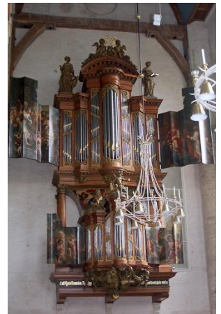
Middelburg Nieuwe kerk