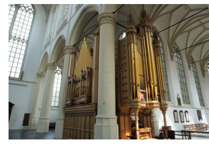
Leiden Hooglandse Kerk

Tour members will be required to make their own way to Holland, where they will be met at and returned to Schiphol airport, or travel arrangements will be made in due time. All the travelling during the tour will be carried out by three coaches and is included in the overall price.