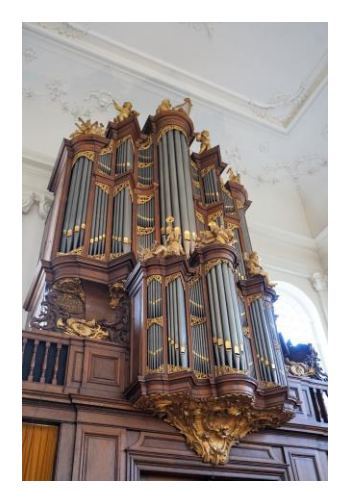
Den Haag Ev. Luth. Kerk