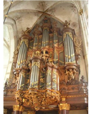
Zwolle Grote Kerk

Tour members will be required to make their own way to Holland, where they will be met at and returned to Schiphol airport, or travel arrangements will be made in due time. All the travelling during the tour will be carried out by coach and is included in the overall price.