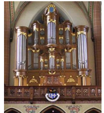
Zwolle O.L.V. Kerk