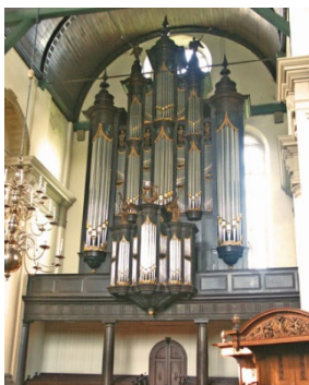
Groningen Nieuwe Kerk